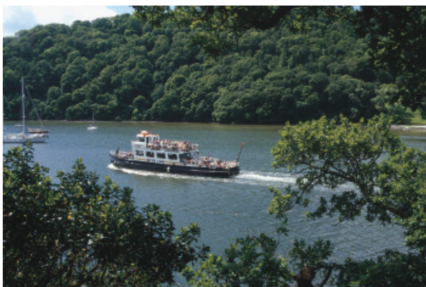
A vessel of the River Link fleet off Greenway, returning to Dartmouth.