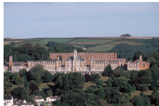
Britannia Royal Naval College, opened September 1905.