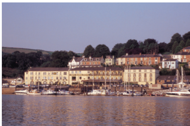
Sandquay, once the site of considerable shipbuilding, including Philip & Son's Yard, now the location of the Dart Marina Hotel with its adjacent marina.